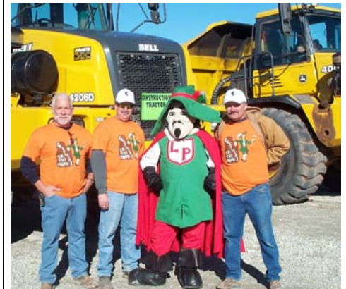
School Mascot "Cavalier" with Illinois Cement operators. Note the small head barely visible in the truck on the right

It was a wonderful opportunity for families to come out and learn what's happening behind the berm.