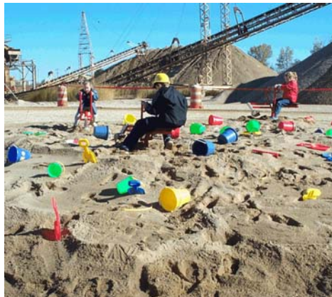
Colorful Sand Pile at Meyer Material Crystal Lake before it was covered with happy children

MEYER MATERIAL OPEN HOUSE AT CRYSTAL LAKE OCTOBER 9th