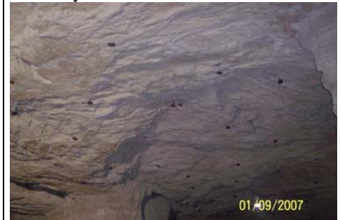
A bolted back outside the freezer.