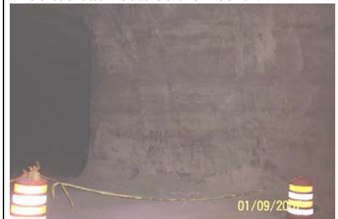
A typical pillar.