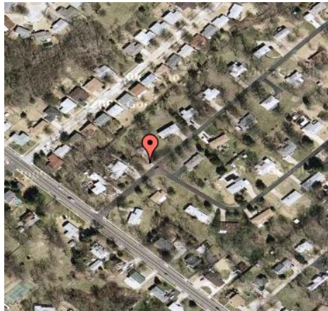
A suburb shot.

The link takes you straight into the North American map. If you click on any part of the map, the map shifts with that location as the map re-centers. If you type a city, or click on one of the states on