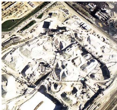
Vulcan's McCook plant

Below is a screen grab a close up of Vulcan's McCook Plant. Outside of the area I grabbed was a reference to Imagery @2005 DigitalGlobe, EarthSat. Can anyone from Vulcan confirm that this is a 2005 image for me?